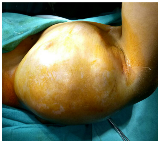
Figure 1 Showing axillary lump of 22×18×10 cm in size.

constitutes <0.03% of all neoplasm and one-third of all desmoid tumours. 2 The most common site for EAF is shoulder and upper limb (33%) followed by lower limb (30%), chest (18%) and head and neck (10%). 3 Although MRI is the imaging modality of choice but diagnosis is confirmed histologically with the evidence of abundant collagen mixed with spindle cells, fibroblasts with abundant eosinophilic cytoplasm. 3,4 The radical surgical excision at earliest is the best treatment modality and avoid the need of chemotherapy, radiotherapy or hormonal therapy to prevent recurrence. 5,6 The axillary fibromatosis is rarely reported in literature and size of 22×18×10 cm is extremely rare. 7 On reviewing all the literatures, the largest size of EAF which was 21 cm in size located over chest wall was reported by Agarwal et al . 8 The EAF of axilla with largest size were 4×4×3 and 10×8×5 cm 3 reported by Pacheco Compañía et al and Duan et al , respectively. 5,9 In the series by Kabir et al and Zehani-Kassar et al , the average size of tumour was 6 and