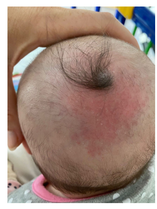
Figure 1 Neonate with scalp hair tuft sign.

Using the venous drainage pattern, SP can be classified into dominant or accessory types.<sup>2 3</sup> The dominant type is when the majority of the venous outflow from the brain occurs through the SP and active treatment through surgical excision should be avoided due to the risk of significant bleeding, venous infarction and sinus thrombosis. The accessory type is when a small portion of the venous outflow occurs through the SP and consideration can be given to treatment with excision or endovascular embolisation, especially if there are neurological